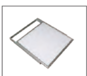
Surface mounting kits